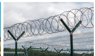
Critical Infrastructure Protection