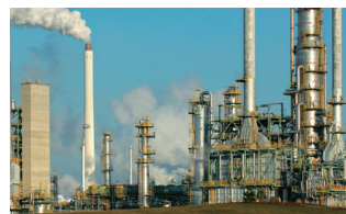
Oil and Gas Pipelines