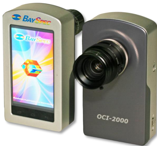
OCI-2000™ Handheld Snapshot Imager