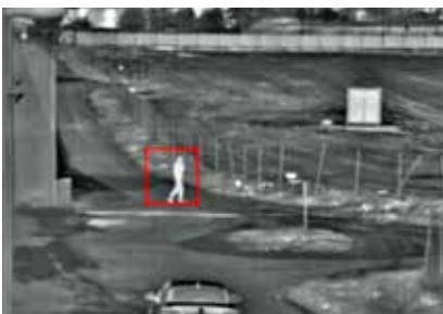
Security teams can observe and investigate any situation during the day or night and even in harsh visibility conditions, such as rain and fog.

Vumii's® Sii AT and Sii OP are 24/7 outdoor security thermal cameras used for observing and monitoring sensitive sites. The cameras provide crisp, clear thermal images in total darkness, daylight, fog, or smoke.