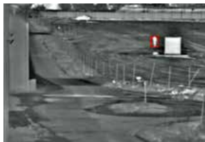
Sii AT identifying a suspicious person outside a prison wall; camouflage will not prevent detection.